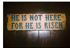
Garden Tomb entrance